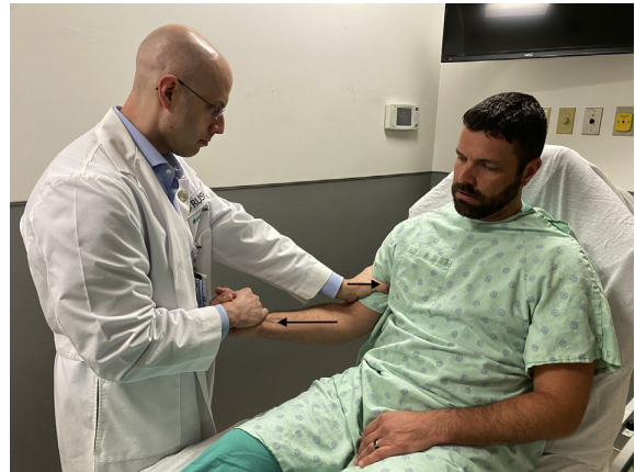
Figure 2. Traction-countertraction technique using the clinician's arm for countertraction.

Leverage technique. The leverage technique was first described by Hankin 25 in 1984 and offers an alternate single-person technique for the reduction of elbow dislocations. With this technique, the clinician interlocks their fingers with the patient's fingers in a clasping grip (Figure 5). If the patient has a longer forearm length than the clinician, grasp the patient's wrist instead of their fingers for this technique. The clinician then places their elbow against the distal portion of the patient's biceps muscle until tension is felt on the patient's flexed arm. Next, the clinician slowly draws the patient's arm into hyperflexion, using their elbow as a fulcrum at the patient's elbow joint. The clinician can use their other hand to guide the patient's olecranon over the distal humerus or to center the olecranon in the case of a posteromedial or posterolateral dislocation. A modification has also been described, wherein the clinician uses their contralateral hand to apply a distracting force on the patient's forearm. 23