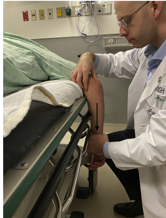
Figure 6. Hanging-arm technique.

Hanging-arm technique. This technique is a modification of the Stimson technique for the shoulder and hip. 26,27 With this technique, the patient leans against a chair or is placed prone on a bed with their forearm hanging over the edge of the bed (Figure 6). 28-30 A clinician then flexes the patient's elbow to 90 degrees and applies axial traction with one hand while guiding the olecranon with the other. This will typically require 1 to 10 minutes to complete. 29,30 Parvin 29 reported the successful reduction of 20 elbows without complication using this technique. An alternate model has been described, in which