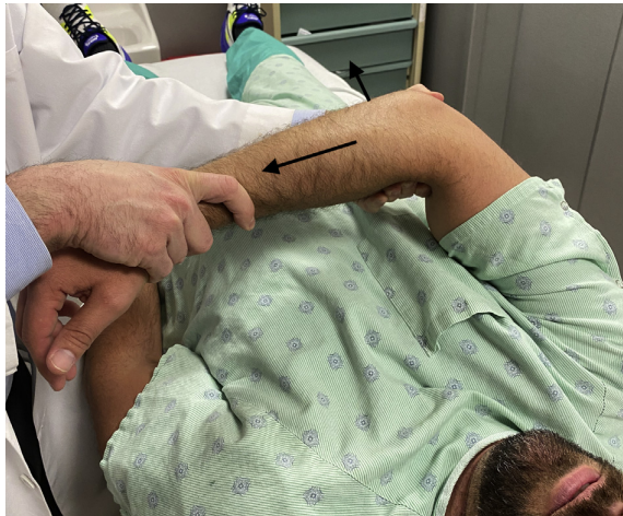
Figure 4. Modified traction-countertraction technique using the patient's body for countertraction.

The original author reported that all 77 cases were successfully reduced without complications using this technique, 25 and another study reported a 100% success rate among 10 dislocations. 23