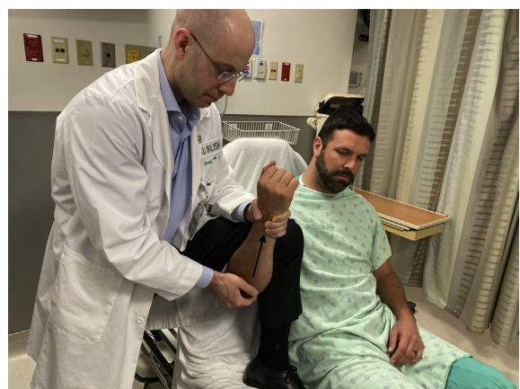
Figure 3. Modified traction-countertraction technique using the clinician's leg for countertraction.

Leverage technique. The leverage technique was first described by Hankin 25 in 1984 and offers an alternate single-person technique for the reduction of elbow dislocations. With this technique, the clinician interlocks their fingers with the patient's fingers in a clasping grip (Figure 5). If the patient has a longer forearm length than the clinician, grasp the patient's wrist instead of their fingers for this technique. The clinician then places their elbow against the distal portion of the patient's biceps muscle until tension is felt on the patient's flexed arm. Next, the clinician slowly draws the patient's arm into hyperflexion, using their elbow as a fulcrum at the patient's elbow joint. The clinician can use their other hand to guide the patient's olecranon over the distal humerus or to center the olecranon in the case of a posteromedial or posterolateral dislocation. A modification has also been described, wherein the clinician uses their contralateral hand to apply a distracting force on the patient's forearm. 23